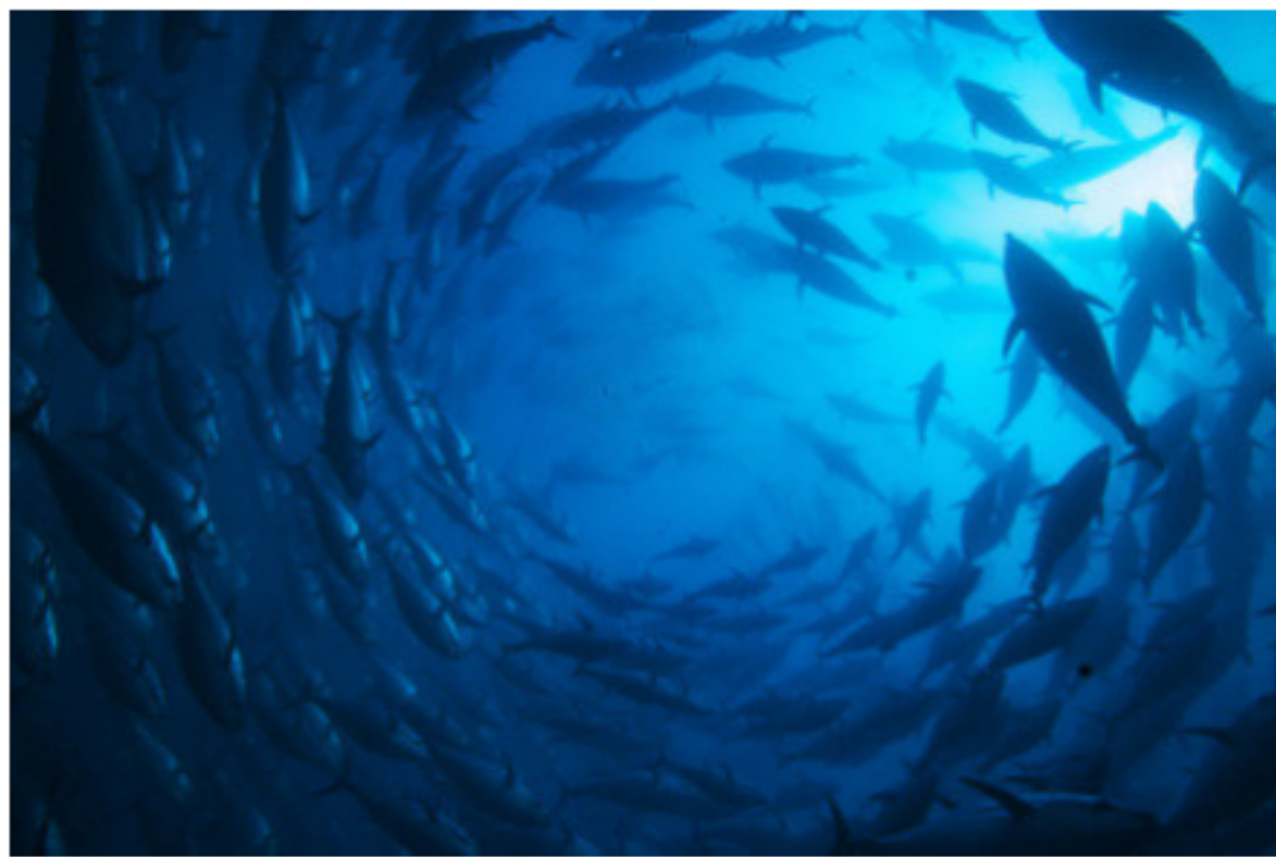
The Last Catch