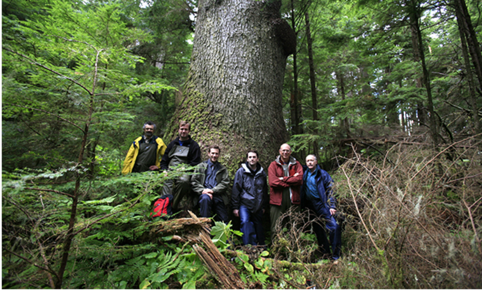
Still from Musicwood

National festival to hold its opening and closing ceremonies at Hackney Picturehouse